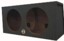
Street Wedge series