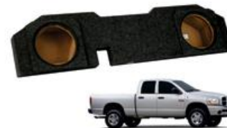
Truck Specific series