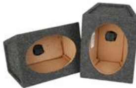
Full Range series