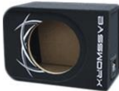
Wedge Back series