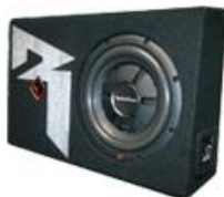
Woofer Specific series