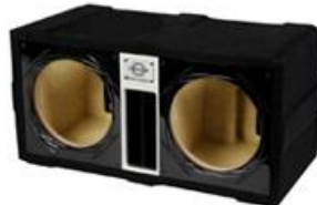
Extreme Gloss series