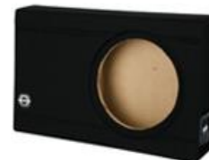
Shallow Woofer series